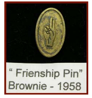
Group Artifacts ** NO ENTRY ** Single Odds/Ends - Bill Green