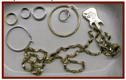
Single Artifact - Lorrie Sprigg