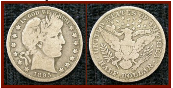
Group Coins - Bill Green