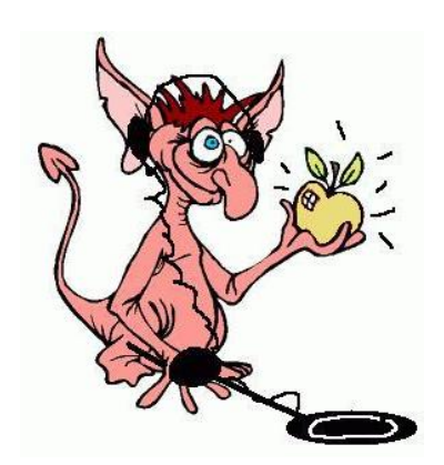
Díd you know?...

The Irish Potato Famine (1845-50) prompted over 700,000 people to immigrate to the Americas. These immigrants brought with them their traditions of Halloween and Jack o' Lanterns, but turnips were not as readily available as back home. They found the American pumpkin to be a more than an adequate replacement. Today, the carved pumpkin is perhaps the most famous icon of the holiday.