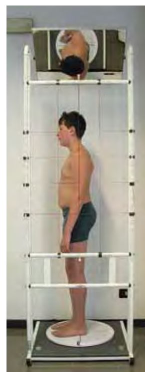
FIG. 2 Postural examination in lateral view: cervical hyperlordosis (increased cervical lordosis) with high dorsal kyphosis (dorsal kyphosis).