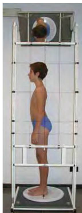
FIG. 1 Postural examination in lateral view: body posture leaning anteriorly with head and shoulders projected forward in relation to the buttocks (front scapulium) and body barycenter moved forward.

The frenectomy or frenotomy is a surgical procedure