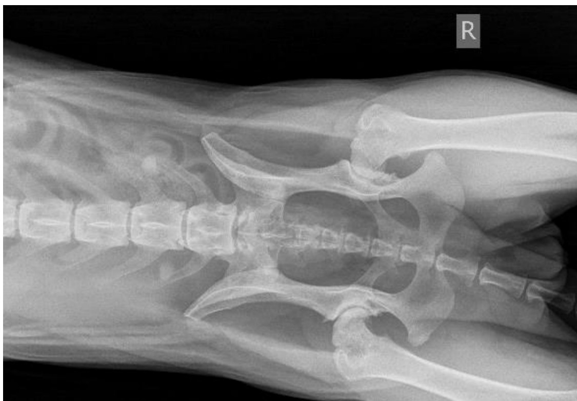
Figure 2. Ventrodorsal projection of dog hips, rated with grade E (original) Slika 2. Ventrodorzalni projekcija kukova psa, ocenjenog na ocenom E (original)

Based on this study, hip dysplasia in dogs is frequent disease, even though it is not noticeable phenotypically and leaves significant repercussions on the health of dogs. The mandatory radiography of hips and a commitment to the programme of selection is very important for the reduction of incidence of HD and the improvement of the quality of purebred dogs. Dogs in which HD has been diagnosed have a high risk of dysplastic offspring and therefore such dogs should be excluded from breeding (Stanin, 2011). The influence of this data on the eradication of hip dysplasia in dogs lies mainly in the breeders hands and their ability to understand and accept the results, as well as to adhere to the veterinarian's recommendations.