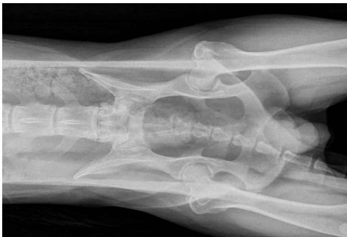
Figure 1. Ventrodorsal projection of dog hips, rated with grade A (original) Slika 1. Ventrodorzalna projekcija kukova psa, ocenjenog sa ocenom A (original)

On the other hand, the lowest Norberg angle below 80^\circ had patients with patient number 5 and estimate E, a patient with a patient number 7 and estimate C and a patient with a patient number 12 and an estimate of E. As for changes in the coverage of the femur head the most expressed is in a patient with patient number 5, in which the joints were completely in the luxation, the center of the femur head compared to the dorsal edge of the acetabulum was over 10 mm. Changes in the femur bone are the next parameter to the frequency, which was present in nine dogs. Most often, this was the initial stage in which the head of the femur remained largely unchanged, but the changes involved the neck of the femur. The neck loses its shape, becomes cylindrical with a milder degree of exostoses, and in a patient with grade E, patient number 5, the head was completely deformed with massive exostoses. Due to the inadequate position between the head of the femur and the acetabulum, its easy to have deformation on the cranialateral edge of the acetabulum, covered with exostoses, also present in 9 dogs. The occurrence of the subchondral ossification of the cranial edge of the acetabulum was less commonly observed in 4 patients. Morgan's lines were the least represented, in only 2 cases, as changes that usually occur in the older age. Patient with patient number 5 had the worst finding of severe dysplasia, shown in Figure 2.