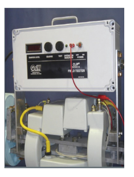
Field test unit and redundant sensing and firing logic