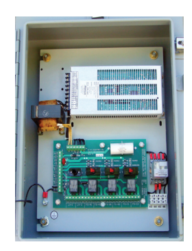
Control box with inverter