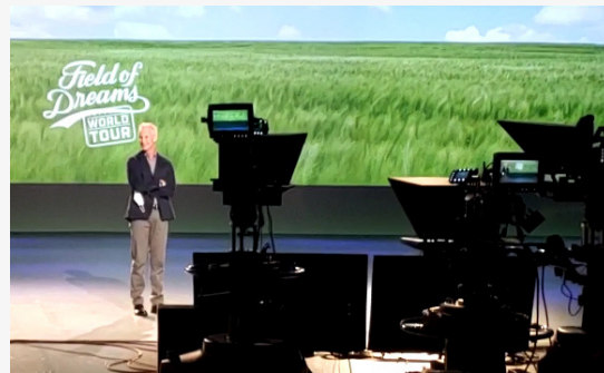
Fremont Studios - Seattle

This is why working with professionals is crucial. Ducks in a Row Events worked with several vendors and organizations in 2020. We have the creativity and resources to produce awesome virtual events with all budget levels.