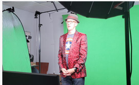
ASAPC Office - Puyallup