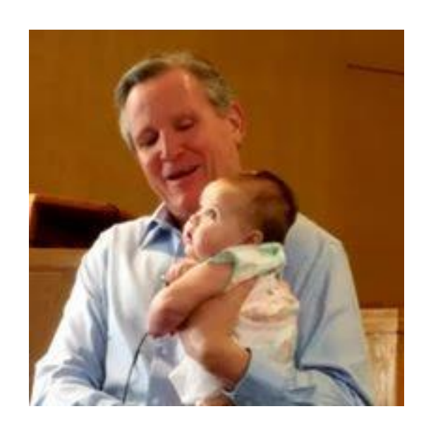
Youth Group Babysitting Night