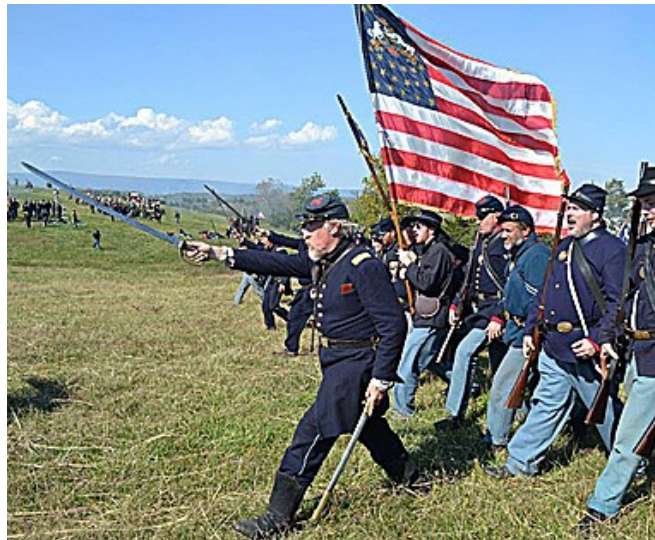
The 7th Maryland advances forward.