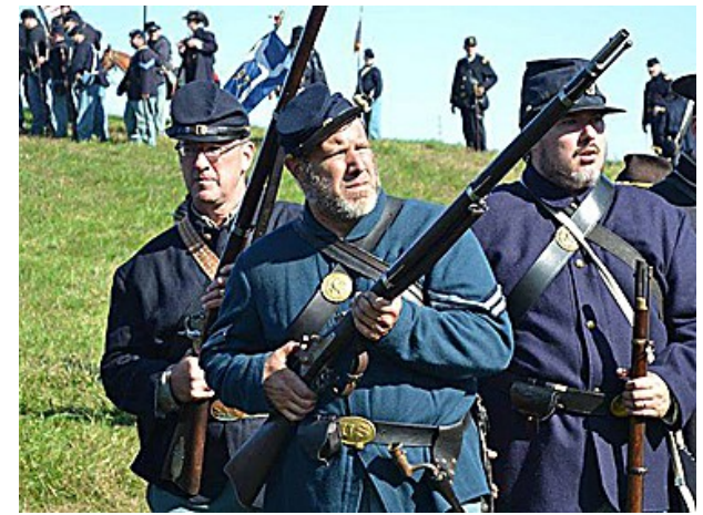
Waiting to go into action.