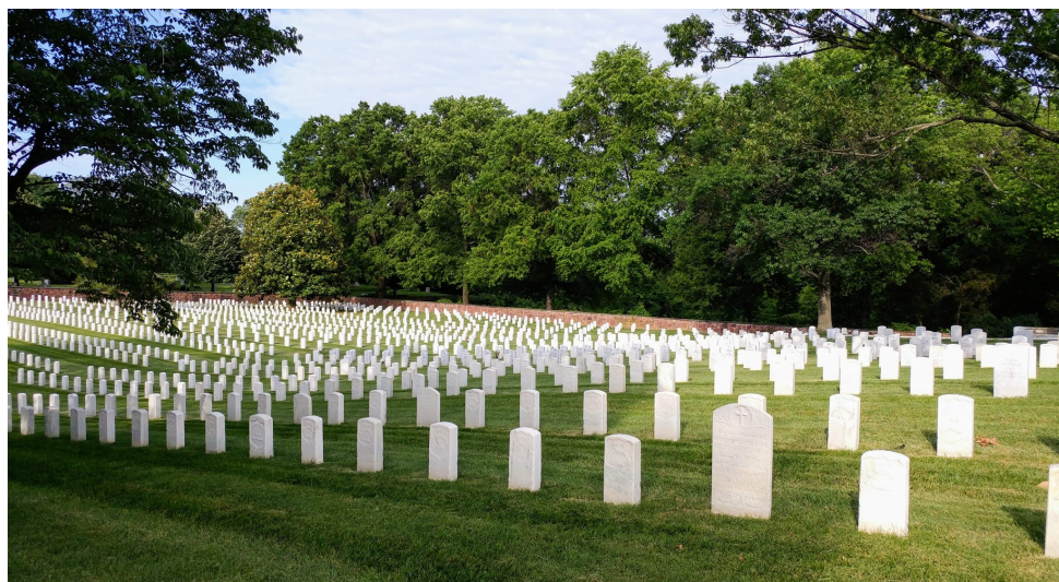
Alexandria National Cemetery.