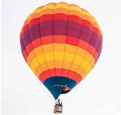
Hudson Hot Air Affair

To the left you see the basics. The Chicago skyline, the hot air balloon, the magnolias and the double exposure cloud image that solved my toning issue. I extracted the magnolia flowers and duplicated them many times to add the “floating blossoms”. The skyline was cropped to avoid distractions. Magnolia flowers were attached to the hot air balloon. Additionally, I layered the piece with a very light off white texture, applying it to the background only. “Up Up & Away” was born!