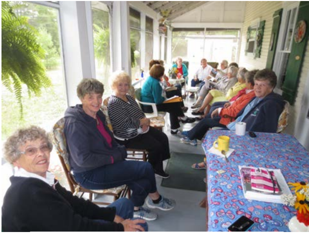
The book club in action

Still Life introduces an engaging series hero in Inspector Gamache of the Surêté du Québec and his team of investigators who are called in to the scene of a suspicious death in a rural village south of Montreal. Jane Neal, a local fixture in the tiny hamlet of Three Pines, just north of the U.S. border, has been found dead in the woods.