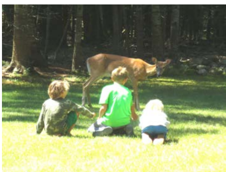
Kids enjoying the visiting doe!

Below are the many artists participating in this fun event!