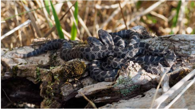
A pile of newborn BBI massasaugas (Photographer Eric McCluskey, Fall 2017)

Secondly, they gather genetic samples that will be used to understand how connected the snakes are across the island, and how this compares to populations in the southern part of their range.