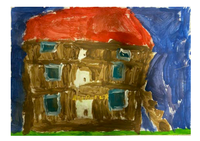
"Red Roof Lodge" by Vaida Riddle, age 6