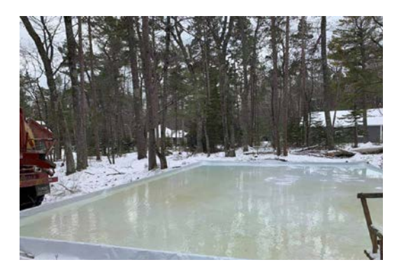
And, by the way, who says the adults don't have fun on the island in the dead of winter?

What a great opportunity for our school & our community! With 11 kids on the island this winter how wonderful that this finally happened!