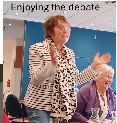
Enjoying the debate