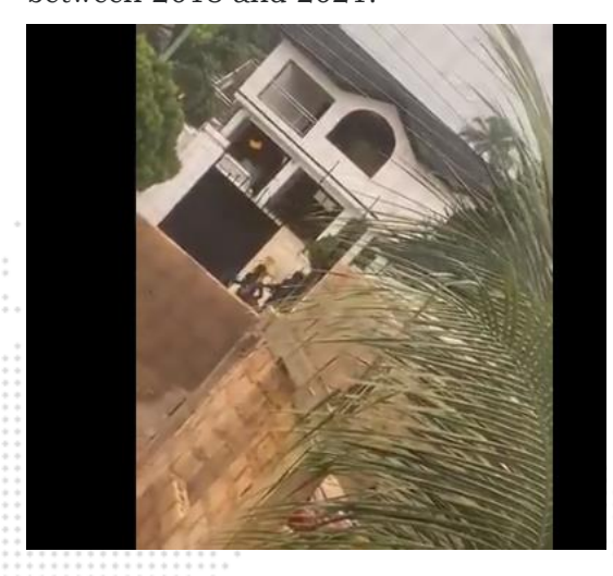
Photo 7: Snippet from a video showing the armed men who attacked Imo State Governor's house in Oru East LGA