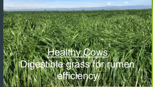
Healthy Cows Digestible grass for rumen efficiency