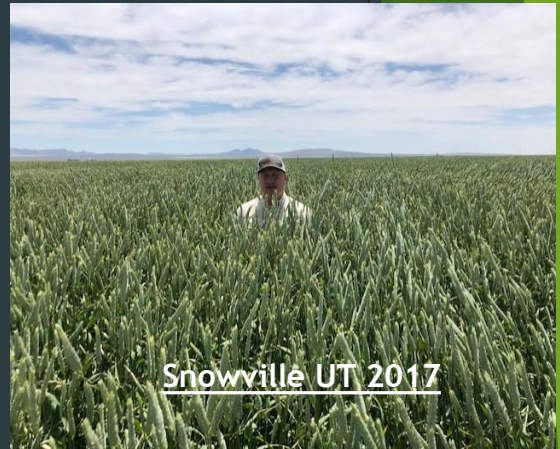
Snowville UT 2017

TriCal 131 is a completely awnless winter triticale. Excellent option in grazing or silage systems. Very good regrowth in grazing system as well as good against disease and drought stress. Vigorous fall growth. Good hay option as well