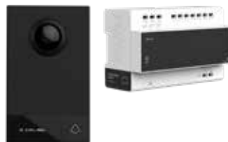
Videokit, 2-wire, with access control module and internal video unit ref. 510-01001