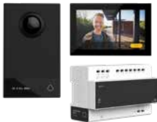
Video kit, 2-wire, with access control module, external and internal video unit ref. 510-01501

You can connect up to 5 internal video units to the same module and even use them as an intercom to connect different parts of your home. Or what about a second external video unit for your back door or home office? The possibilities are endless .