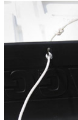
Slide knot of Distance Regulator Cord through slot on front leg of opposite board