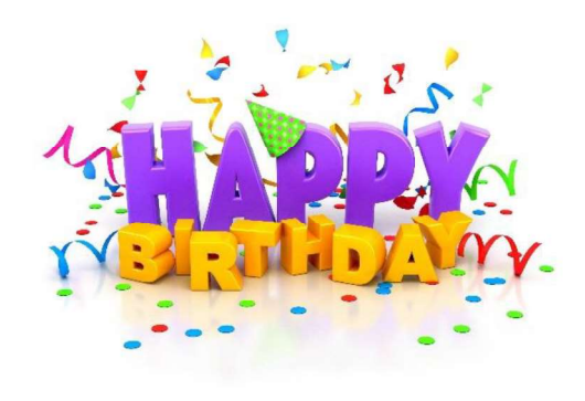
52 years 102 years