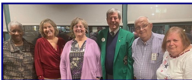
Morgantown Area Lions