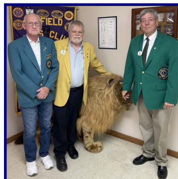
Putnam County Lions