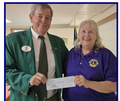
Mt Olivet Lions