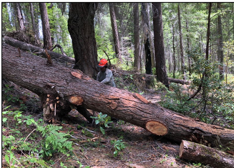
Alan Woods (all photos) did the bulk of the chainsaw work.

across the trail for years. While the trail still needs more work to be safe for all users, these efforts helped prep the trail for an American Conservation Experience (ACE) crew that was scheduled to do three 8-day hitches on the PCT southbound out of Grider Creek TH on June 12. We look forward to doing more work on the PCT in the future.