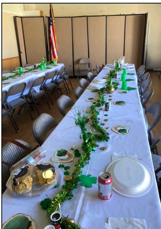
Tables were very festive for St. Patrick's Day.