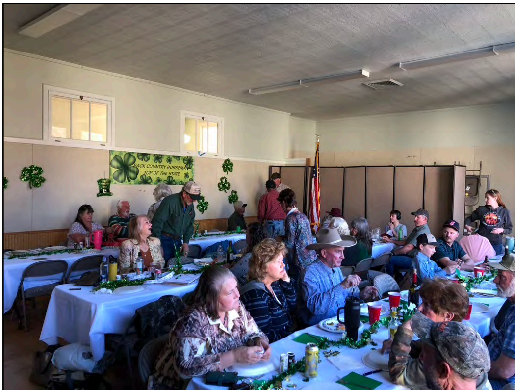
More than 60 members and guests enjoyed corned beef and other potluck dishes.