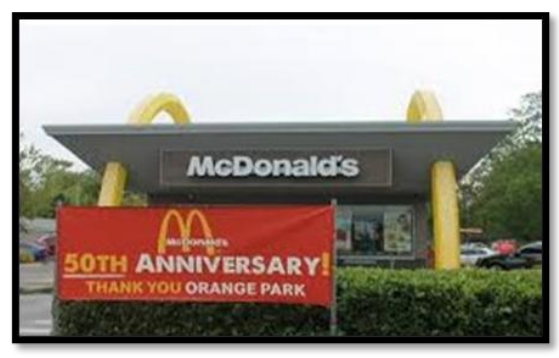
McDonald's, 428 Park Avenue & 372 Blanding Blvd., Orange Park