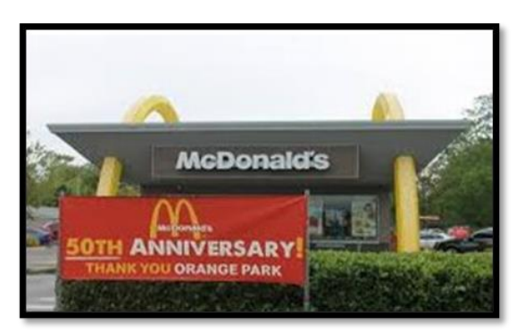
McDonald's, 428 Park Avenue & 372 Blanding Blvd., Orange Park