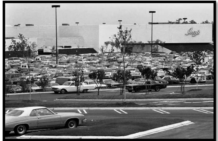
Orange Park Mall - 1975