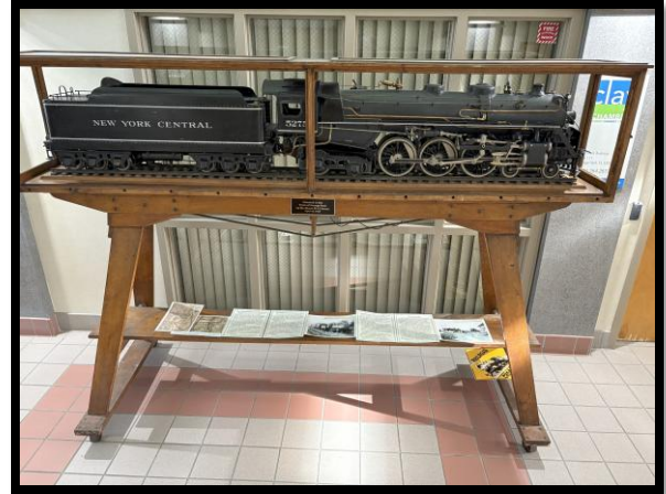
Model Railroad Display with Clay County Railroad History