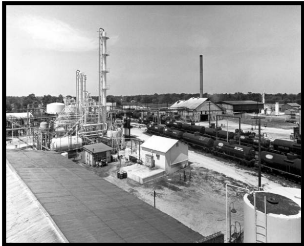
Glidden Company Chemical Plant in Jacksonville. (1960)

His work is now used to flavor toothpaste, mouthwash, vitamin pills and candies and to create scents for perfumes, soaps and detergents.