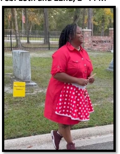
Feb. 15th and 22nd. 2 -4 PM

Join us on Saturday February 15 or Saturday, February 22, for our inaugural Black History Walks at Magnolia Cemetery. These tours, similar to the popular Moonlight on Magnolia tours done in October, will focus exclusively on the fascinating African American history of the town. Tours begin on the hour, 2 pm and 3 pm.