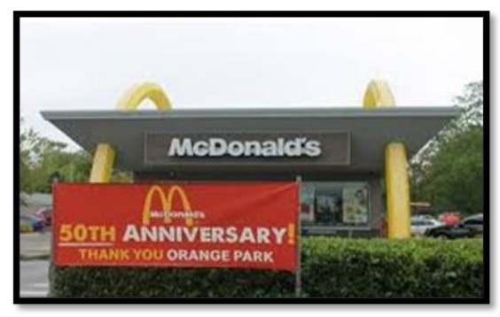
McDonald's, 428 Park Avenue & 372 Blanding Blvd., Orange Park