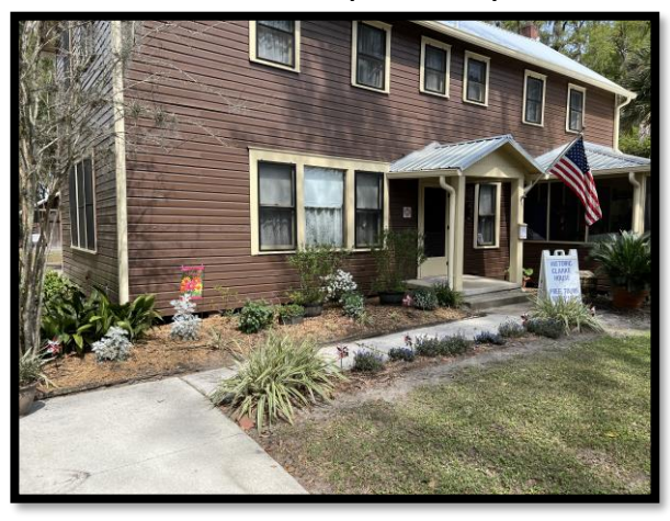
The Clarke House was looking good for her big day.