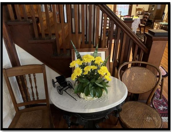
One of the many beautiful flower arrangements in the Clarke House.