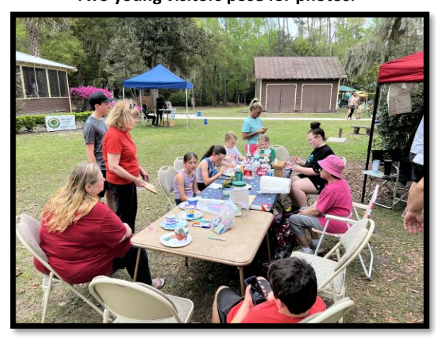
Members of the Art Guild of Orange Park help young visitors decorate flowerpots.