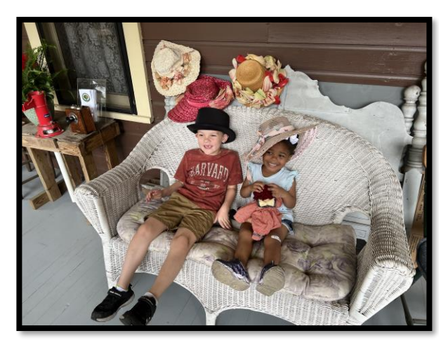
Two young visitors pose for photos.