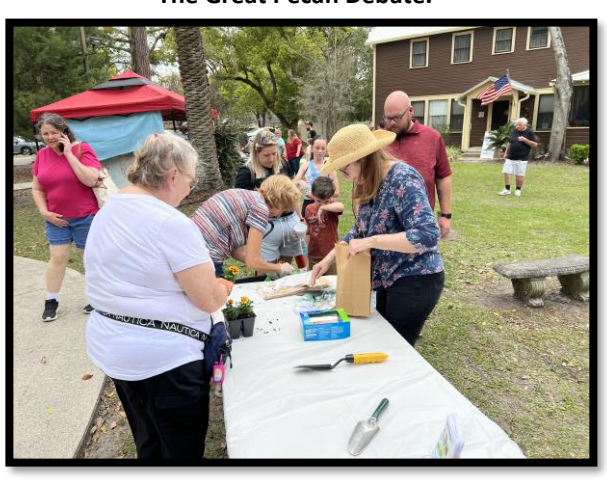
Members of the Garden Club of Orange Park help visitors fill their new pots with a plant.