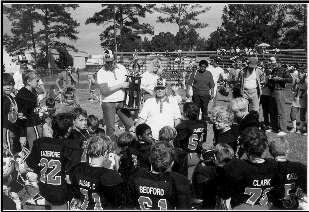
The OPAA Cyclones and their 1987 championship trophy