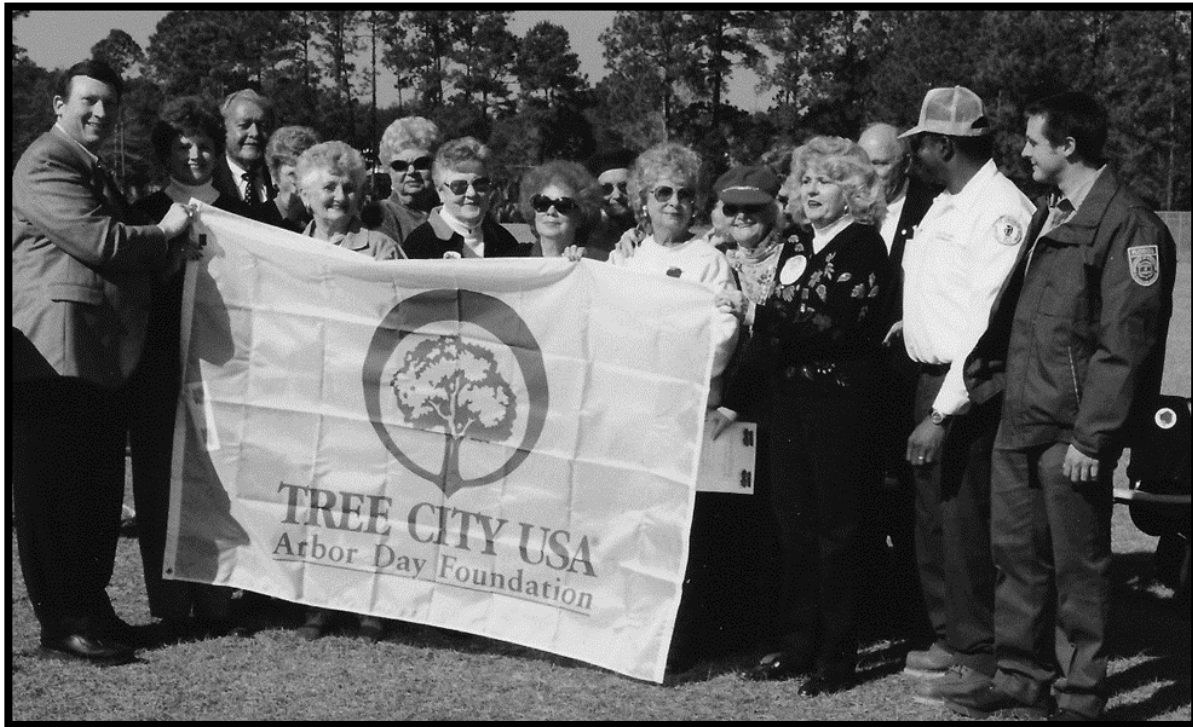
The Town of Orange Park is recognized as a Tree City, USA

Town Council meetings were filled with actions revolving around roads and maintenance of the town's public swimming pool.