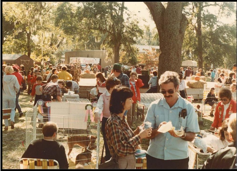
The Town of Orange Park's Fall Festival