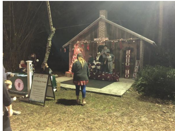
Hometown Holiday 2020