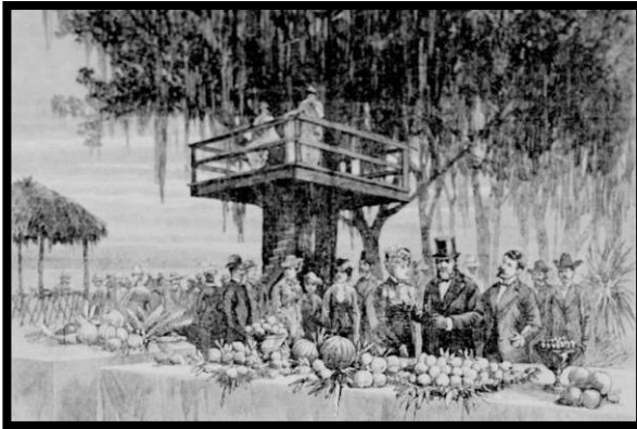
The original Long Table at a visit by President Ulysses S. Grant in 1880