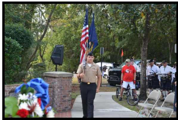
The Orange Park High School NJROTC Color Guard