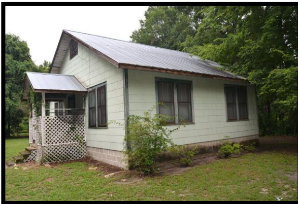
Green Cottage, Clarke House Park