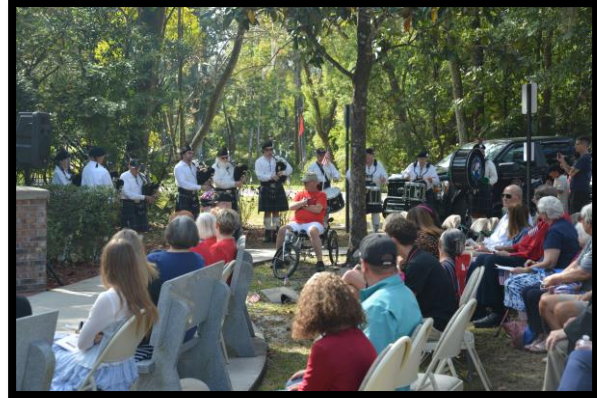
The First Coast Highlanders

Another prominent part of the ceremony was the announcement of the results of the annual Essay Contest and the reading of the winning essays. The winners of the essay contest were as follows: