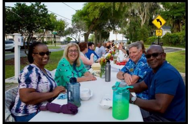
Modern day Long Table near the east end of Kingsley Avenue