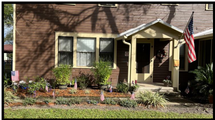
The wreaths and flowers that decorated the memorial as well as the flowers decorating the Clarke House were provided by the Garden Club of Orange Park