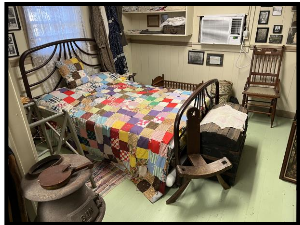
Roundtable attendees visit the Middleburg Museum