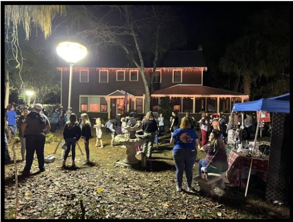
Hometown Holiday 2021