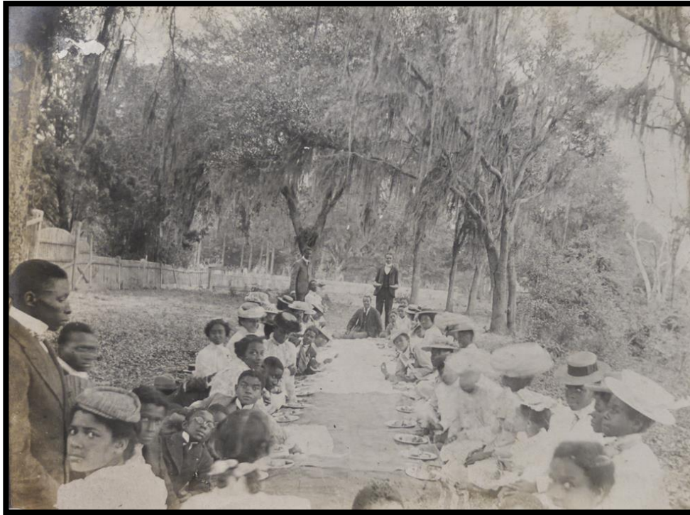
Students, family and friends gather on the grounds of the Orange Park Normal and Industrial School for a picnic, c.1902