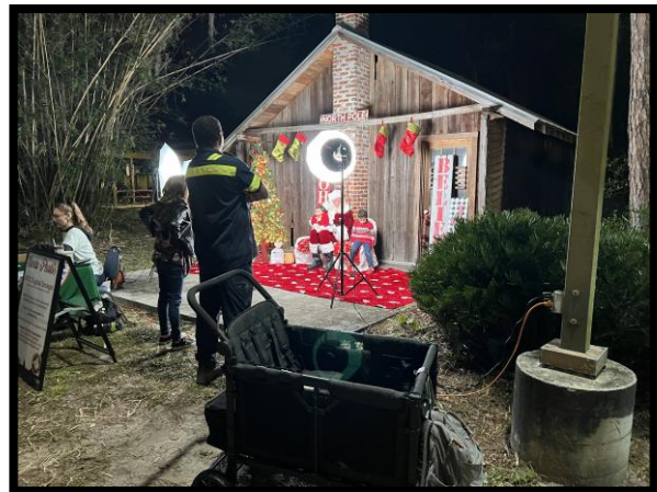
Scenes from Hometown Holiday