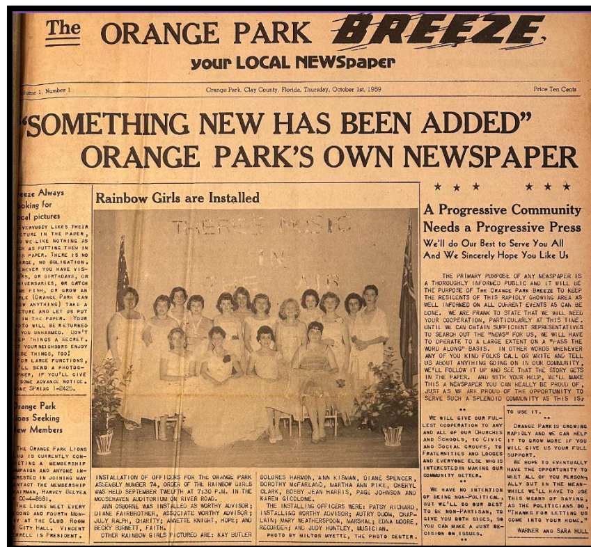
The Front Page of the First Edition of "The Breeze", October 1, 1959

The Historical Society of Orange Park will be celebrating the warm, rich, charming and sometimes quirky history of our town. Each month of 2024 we will post a vintage newspaper clip from The Breeze newspaper, which ran from 1959 to 1971. Check this newsletter each month for a flashback to earlier days.