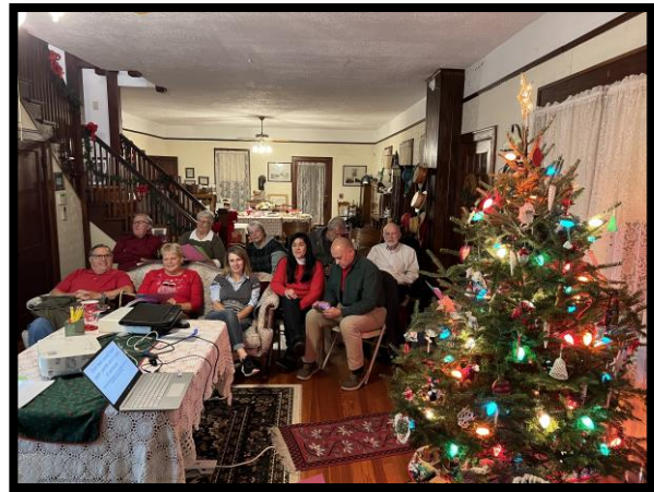
HSOP Holiday Gathering