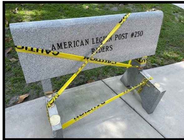
Repairs are underway!