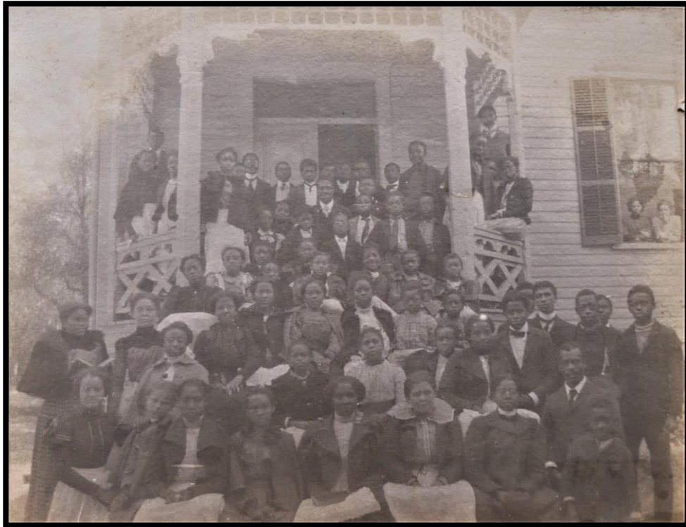
Student Gathering at the Front of Hildreth Hall

While many of the Butcher's photographs were shown at our February meeting, we thought it would be good to share a few of their photos with you here. Following are a few of the photographs taken by the Butcher family: