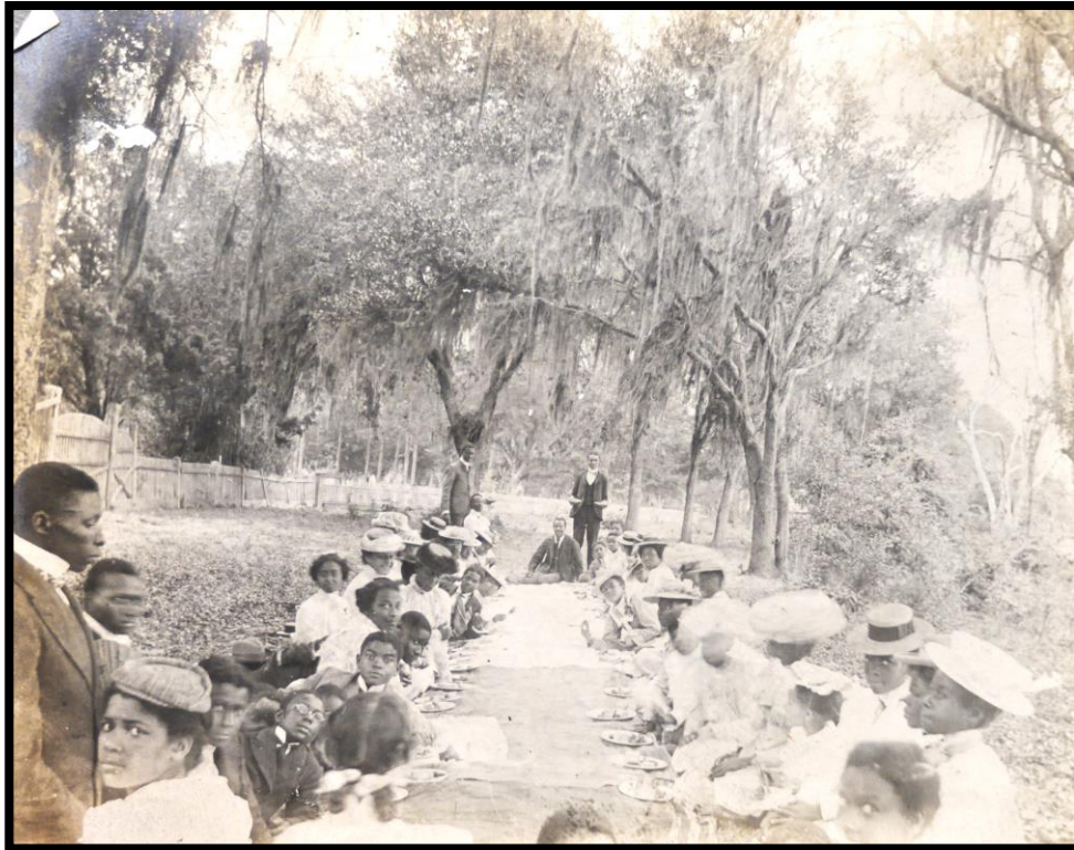
Picnic on the Ground