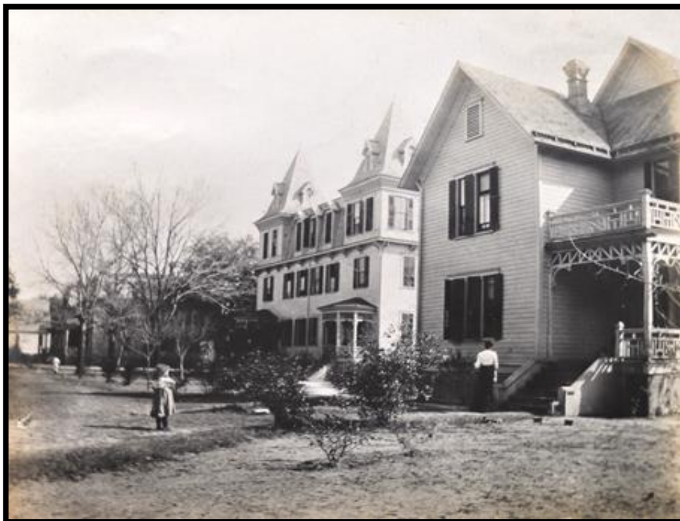
Normal School Buildings. From L to R: Congregationalist Church, Girl's Dorm, Hildreth Hall and Boy's Dorm