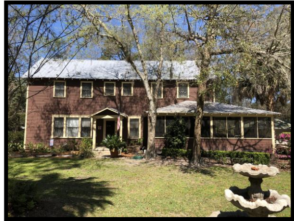
The Clarke House: 2003 to Today