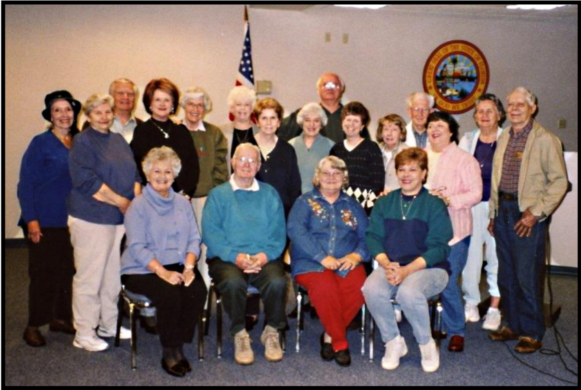
Founding Members of the Historical Society of Orange Park, March 2003