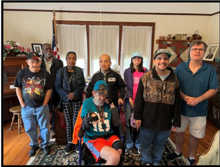
Visitors from The Arc Jacksonville at the Clarke House