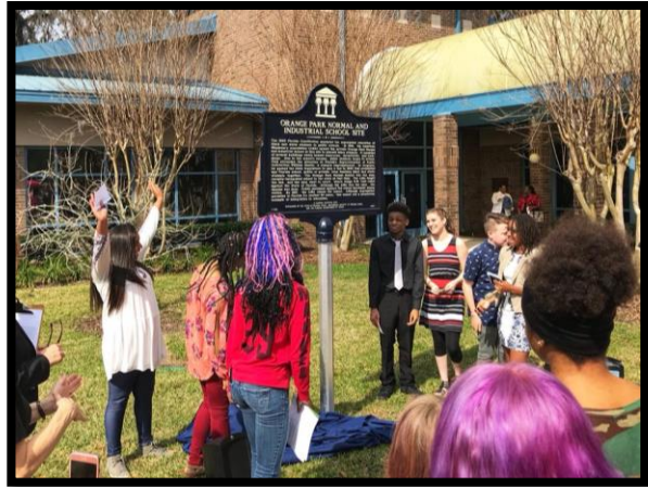
Dedication of the historical marker for the Orange Park Normal School, 2018