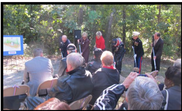
Groundbreaking for the Veterans Memorial, 2011