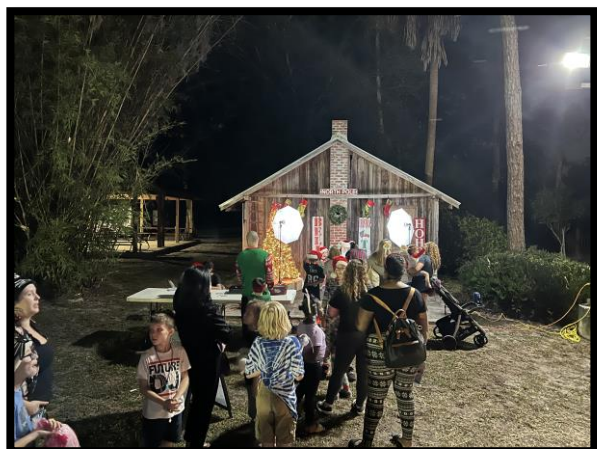
Hometown Holiday in the Park