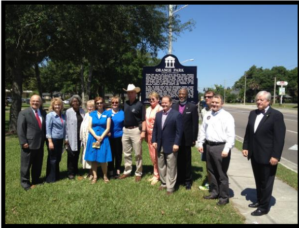
Dedication of the historical marker for the Town of Orange Park, 2014