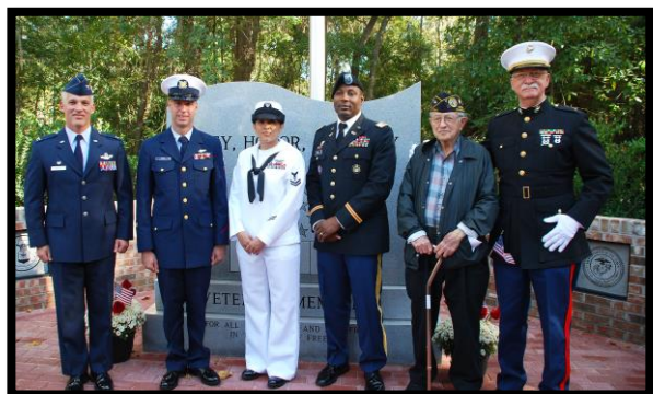
Veterans Day Ceremony