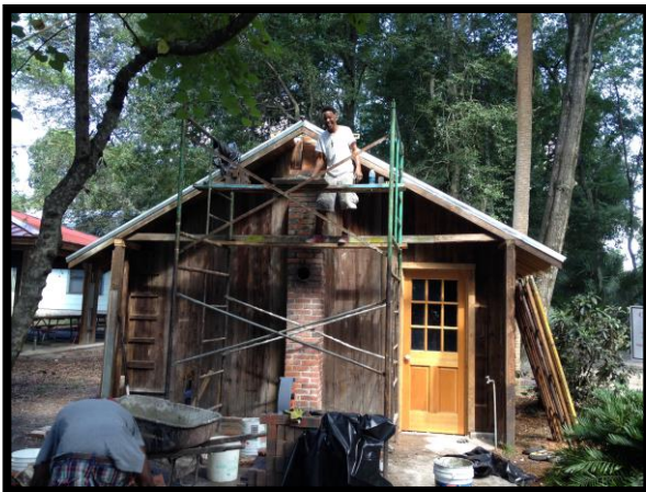
Clarke House Shed Renovation, 2011