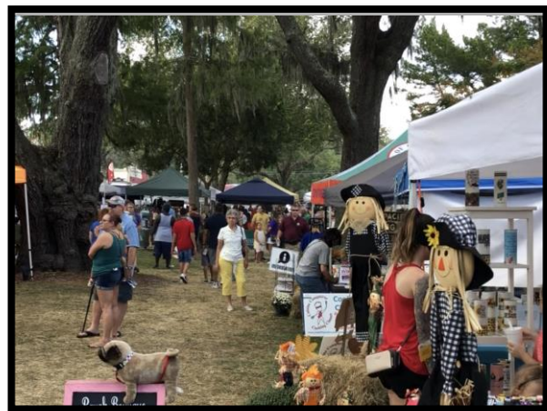
Scenes from Fall Festival 2021