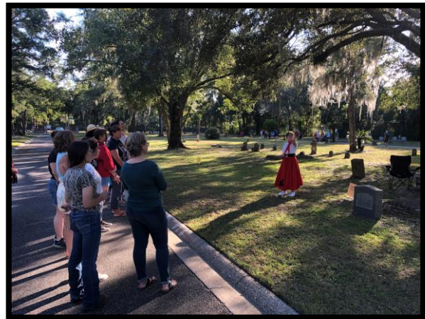
Moonlight on Magnolia 2021