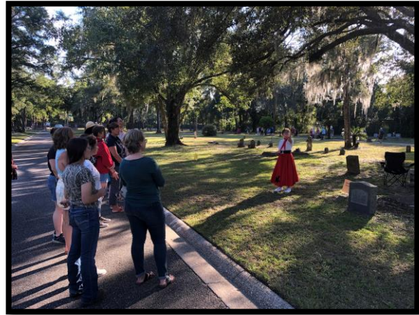
Moonlight on Magnolia 2021