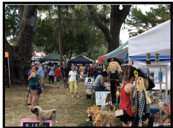
Scenes from Fall Festival 2021