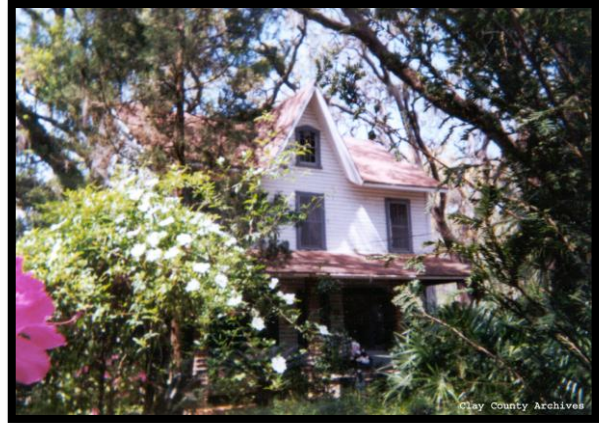
Helffrich House – Late 1900's