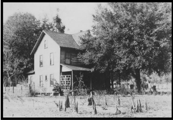
Helffrich House - 1915