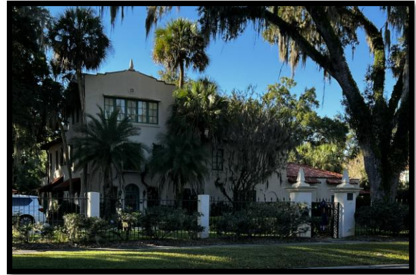
Via Tisdale Home