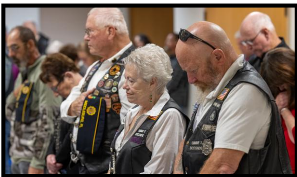
Members of American Legion Post #250

even if we feel our actions are too small. Together we build the story of community, exemplified in this ceremony, which undergirds our history.