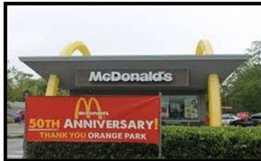
McDonald's, 428 Park Avenue & 372 Blanding Blvd., Orange Park