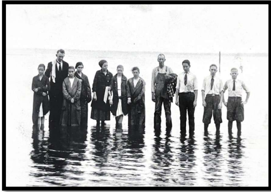
Early Baptism in the St. Johns River