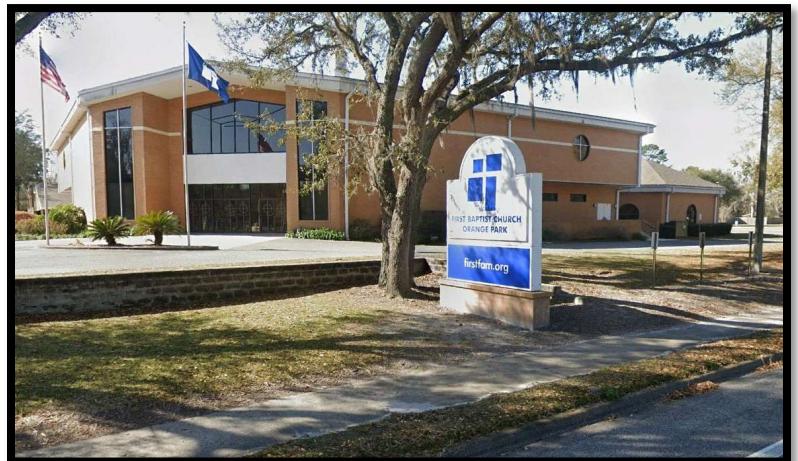
First Baptist Church of Orange Park