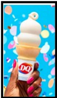
Dairy Queen, 610 Kingsley Avenue, Orange Park