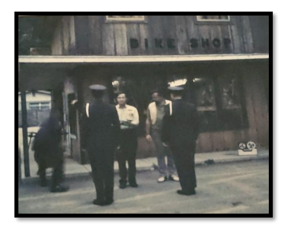
Freeman's Bike Shop