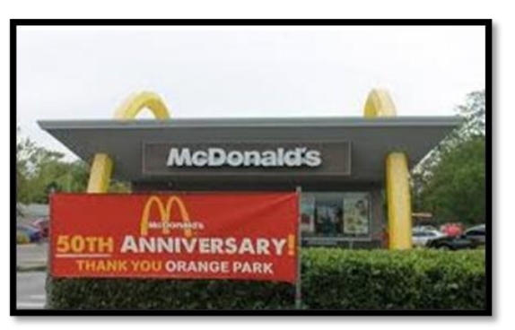
McDonald's, 428 Park Avenue & 372 Blanding Blvd., Orange Park