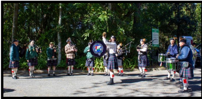
First Coast Highlanders

The Veterans Day program also featured two selections by our old friends, the First Coast Highlanders, and a performance of America the Beautiful, by Pure Harmony.