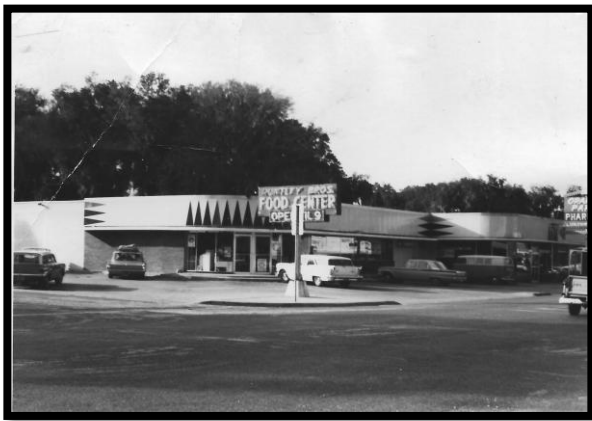
Huntley's Grocery Store