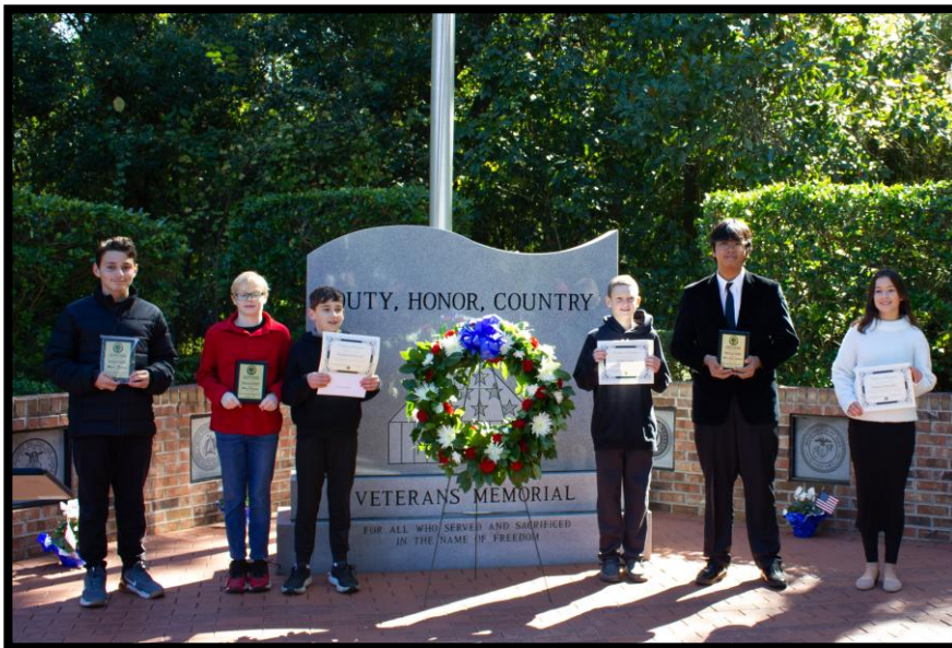
Essay Contest Winners