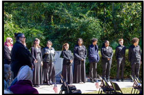
Orange Park High School Chorus, Pure Harmony