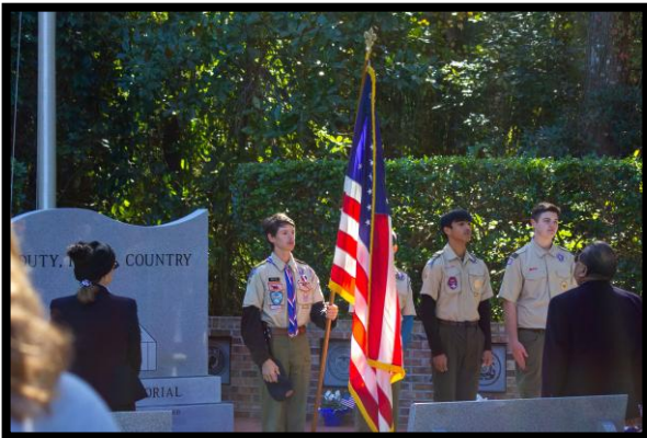
Boy Scout Troop 25