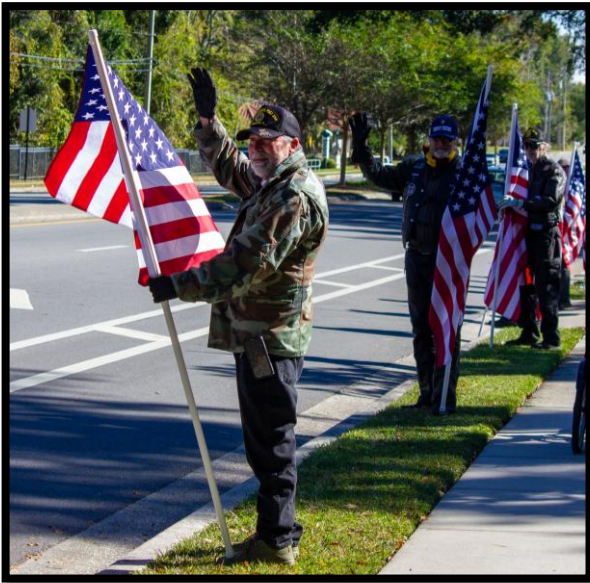
American Legion Post #250 Patriot Guard