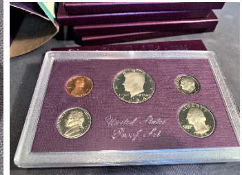
Numerous Proof Sets