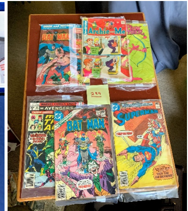
90+ Plastic encased Comic Books

... and much more! Hundreds of items, collectibles and furnishings sell ONLINE ONLY! To register to bid go to ffbaugh.com and click on the Online Sales and Auctions bar.