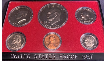
Bicentennial Proof Sets