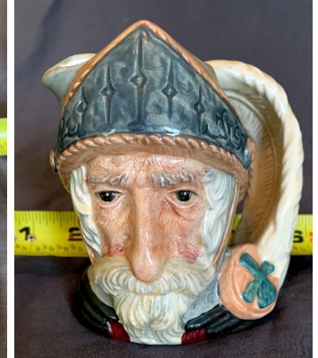
Royal Doulton Toby Mugs