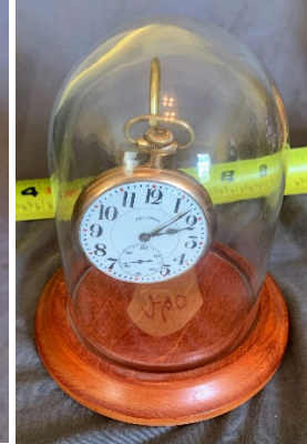
Illinois Pocket Watch