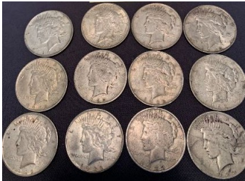
1922 Peace Dollar

Hundreds of collectibles - circulated and uncirculated coins and Proof sets – Hundreds of Hummel Figurines – sports collectibles – furnishings!