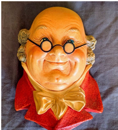
Several Bossons Chalkware