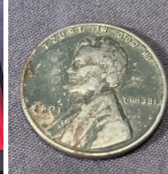
1943 Steel Penny