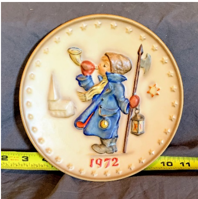
Hundreds of Hummel Figurines and decorative plates