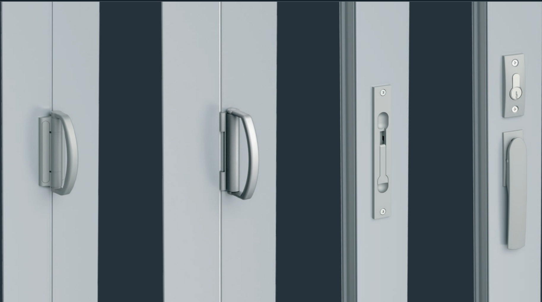
Twin bolt lever