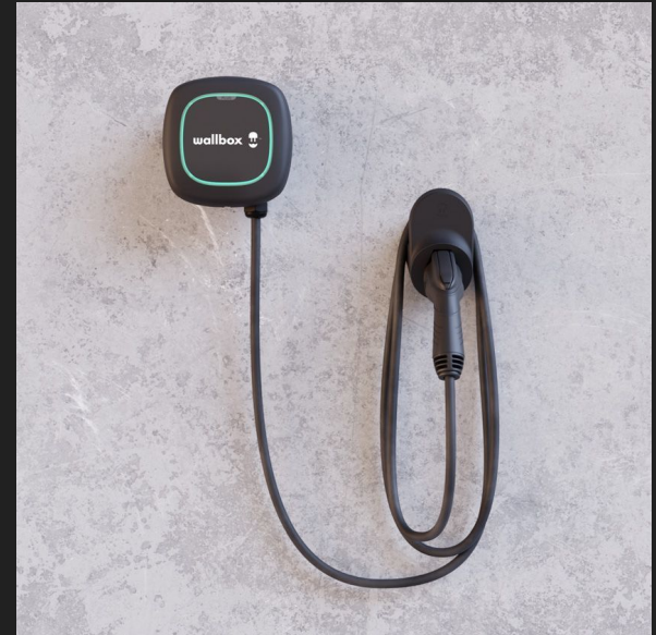
Wallbox Pulsar Plus 48A

https://shop.tesla.com/product/universal-wall-connector