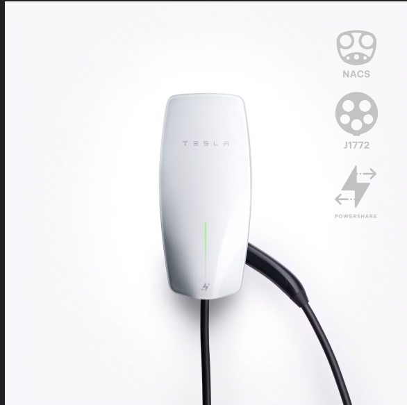
Tesla Universal Wall Connector Gen 3

https://shop.tesla.com/product/universal-wall-connector