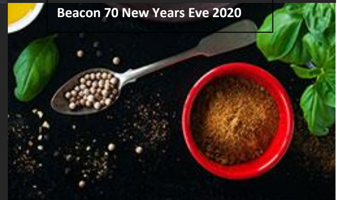
Beacon 70 New Years Eve 2020