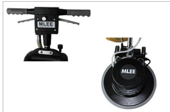
New and improved handle damp eliminates overtightening and damaging the handle tube

The best just got better! To make our floor machines even better, we've added improvements that increase the power and add longer lasting durability for an even stronger machine. The popular Mlee Classic floor machines feature our patented one-piece, rotationally-molded housing that is more durable and resilient than steel. It absorbs the shock and torque normally associated with operating a floor machine while putting the power on the floor, not on the operator's hands. The updated Mlee Classic floor machines provide the necessary strength and toughness for the most challenging floor jobs.