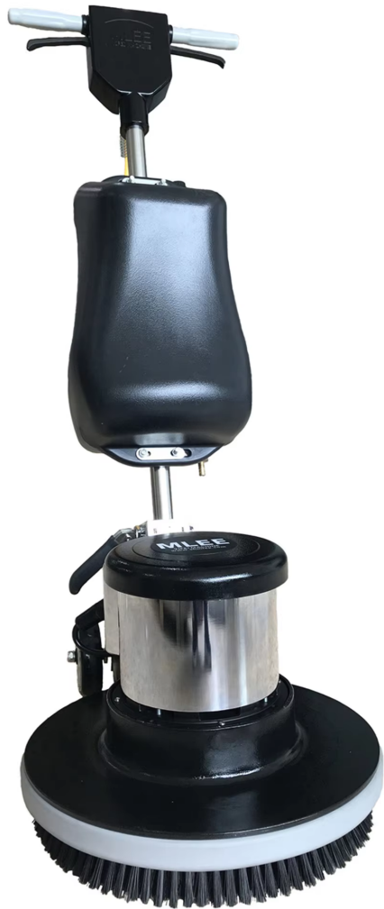
Item# 170F Item# 200F

The best just got better! To make our floor machines even better, we've added improvements that increase the power and add longer lasting durability for an even stronger machine. The popular Mlee Classic floor machines feature our patented one-piece, rotationally-molded housing that is more durable and resilient than steel. It absorbs the shock and torque normally associated with operating a floor machine while putting the power on the floor, not on the operator's hands. The updated Mlee Classic floor machines provide the necessary strength and toughness for the most challenging floor jobs.