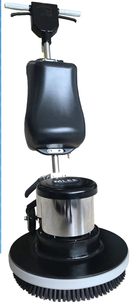
Item# 170F Item# 200F

Item# 170F - Item# 200F, Assembled in China