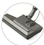
Electric power brush (optional*)