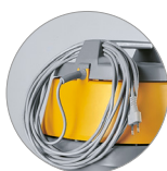
Hook for power supply cable