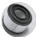
HEPA Cartridge filter (optional*)